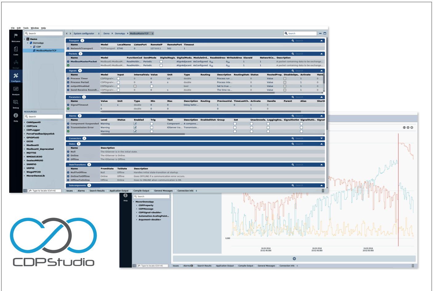
Figure 2: The CDP Studio development environment covers module coding, GUI design, system configuration and run-time analysis.

The IPC is a rather generic term, ranging from powerful industrial servers to small DIN-rail modules. The small IPCs are very well suited for edge computing. For headless (no screen) computers, Linux is now finding more and more acceptance. Linux is already powering most of the world's webservers and cloud services, so finding use in Fog computing should not be a surprise. IPCs are now available from multiple vendors and is posing competition to the big "Automation companies". The IPC for edge computing is just a flexible controller with one or two Ethernet interfaces. The hardware vendor lock-in has completely disappeared as applications run on top of standard operating systems. Remote I/O from the automation world hooks nicely up with Linux computers from the IT world, typically via Modbus TCP. CDP Studio comes with a choice of several pre-configured bus couplers and I/O modules from different vendors like Phoenix Contact, Wago, Weidmüller, and Beckhoff.